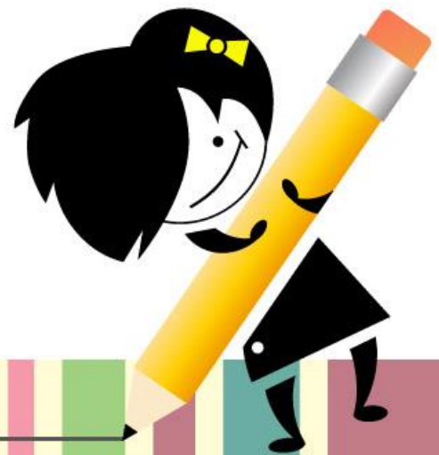
Seshorse and Existencial Cowboy

Tell a story from a world where sea horses are the size of real horses.