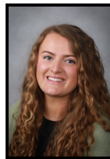
Miss Young Ocelots